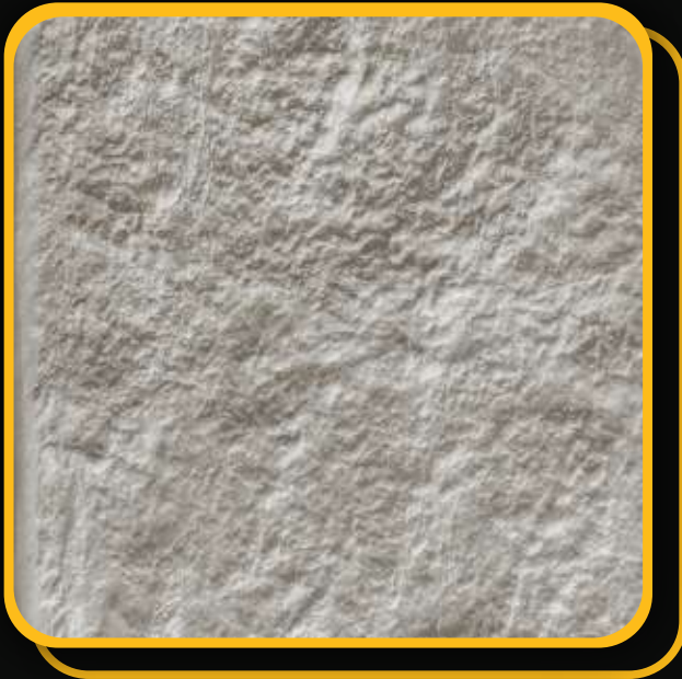
2'x 2' Picture Area