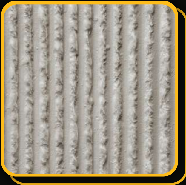
2'x 2' Picture Area

Pattern may require additional backing. We recommend a mockup pour simulating actual job conditions. Refer to Application Guide.