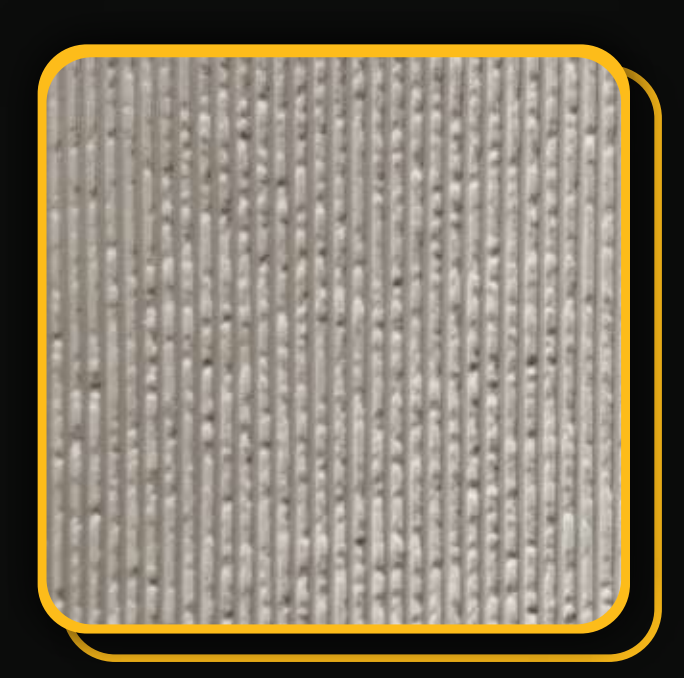
2'x 2' Picture Area

Peoria Fractured Fin - .25" Deep .62" oc