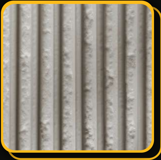
2'x 2' Picture Area

Pattern may require additional backing. We recommend a mockup pour simulating actual job conditions. Refer to Application Guide.