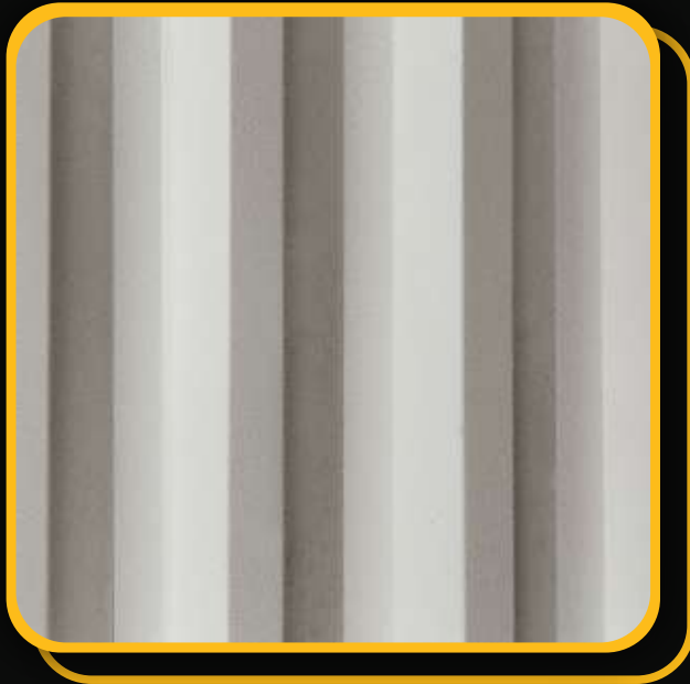
2'x 2' Picture Area

1-1/2" Deep Rib (7" oc; 1-5/8" Peak, 1-5/8" valley)