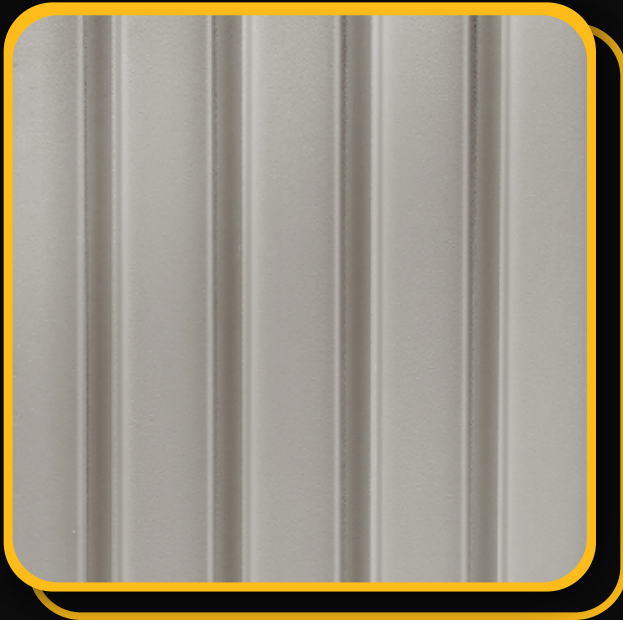
2'x 2' Picture Area

3/4" Deep Rib (4 1/4" oc Rib, 1" Peak, 3" Valley)