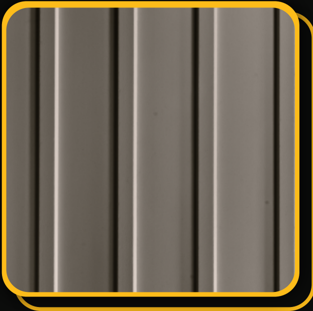
2'x 2' Picture Area

3/4" Deep Rib (8" oc, 1.625" Peak, 6" Valley)