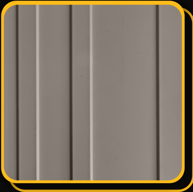
2'x 2' Picture Area