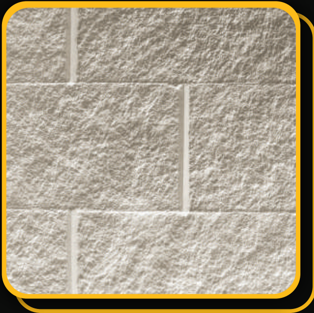
2'x 2' Picture Area