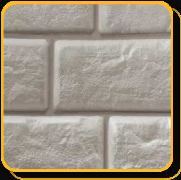
2'x 2' Picture Area