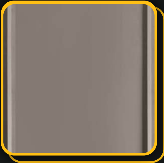
2'x 2' Picture Area